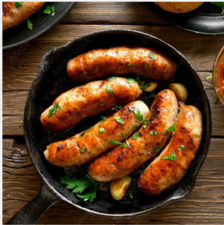
Pork Sausage Meat 455G - £4.50

TREAT YOURSELF TO SOME EXTRAS THIS CHRISTMAS, OUR QUALITY MEATS ARE LOCALLY SOURCED AND SUSTAINABLY PRODUCED.