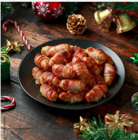
Pigs in Blankets 10 PACK - £5.00