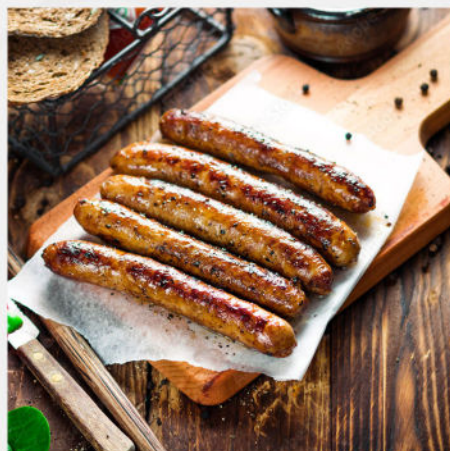
Handmade Chipolata Pork Sausages 1KG - £9.99